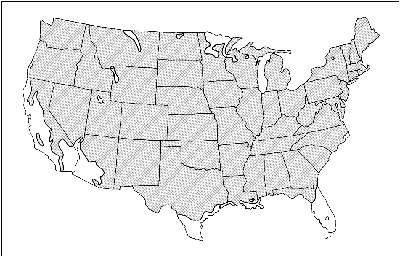
Figure 2. Shaded area represents potential planting range.

Leaflet shape: elliptic (oval); ovate Leaflet venation: pinnate; reticulate Leaf type and persistence: deciduous Leaflet blade length: 2 to 4 inches Leaf color: green Fall color: copper; yellow Fall characteristic: showy