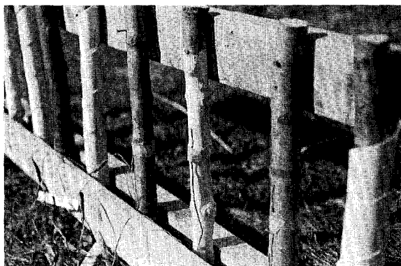
Figure 1. White ash sections on frame showing thermocouple placement and various materials tested.