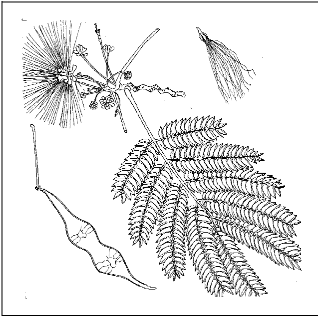
Figure 3. Foliage of Mimosa.

Pest resistance: very sensitive to one or more pests or diseases which can affect tree health or aesthetics