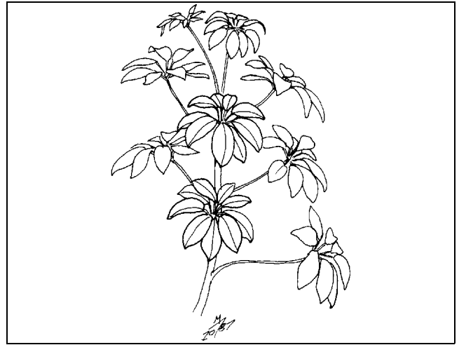
Figure 3. Foliage of Dwarf Schefflera