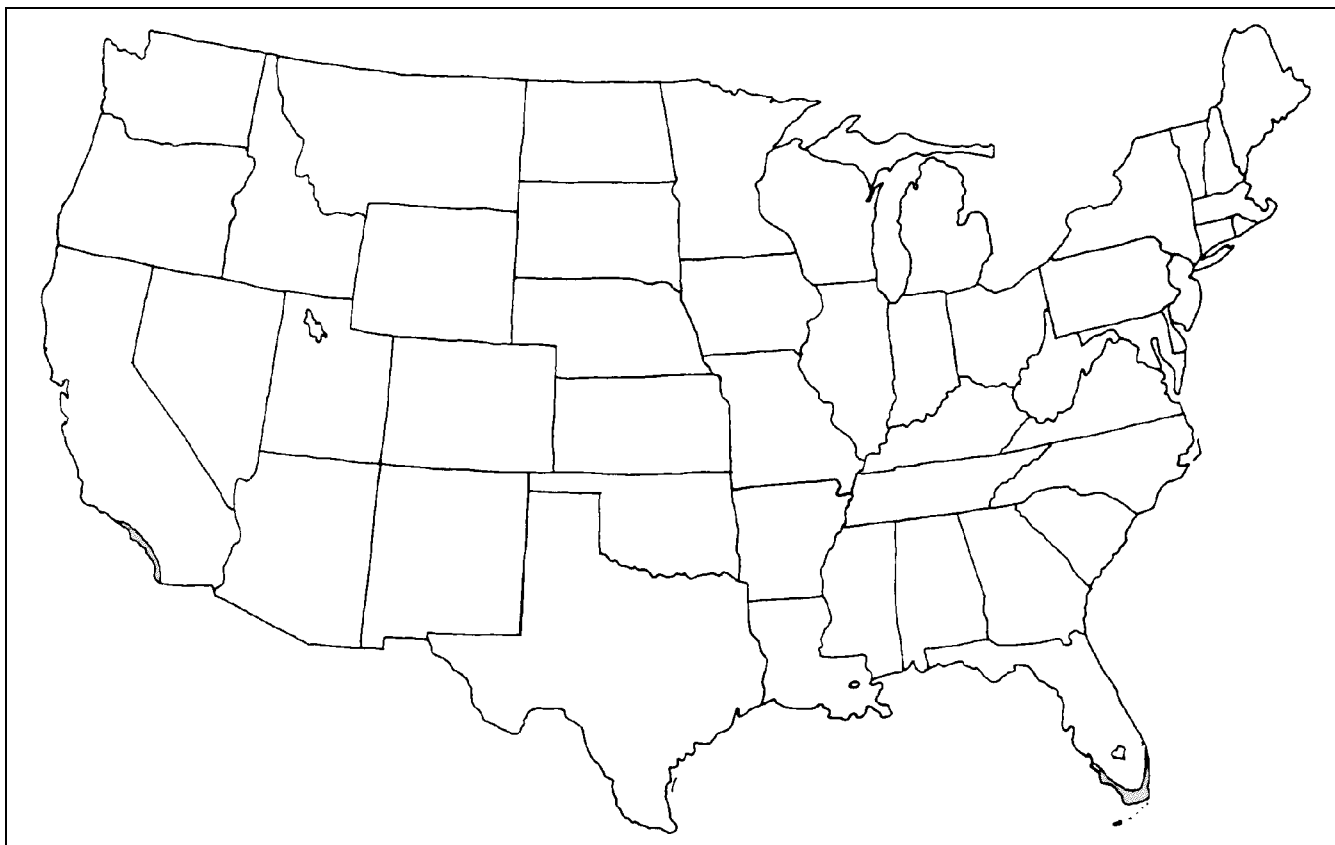
Figure 2. Shaded area represents potential planting range.