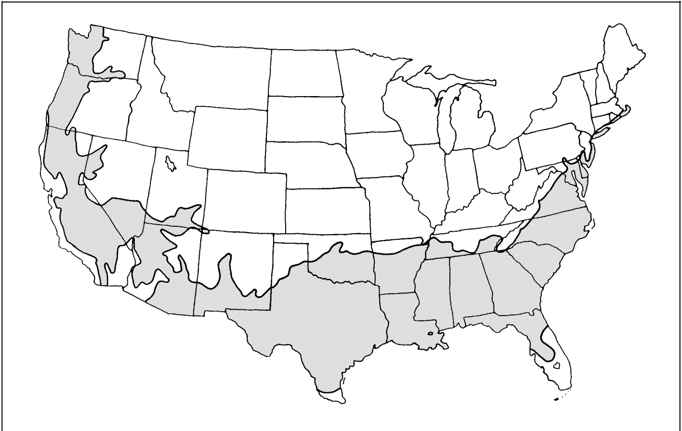
Figure 2. Shaded area represents potential planting range.